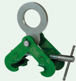
H-Type for beams